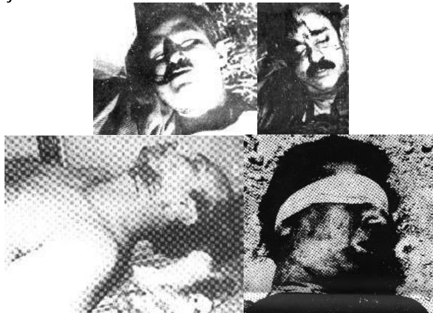
Ethnic cleansing of Kashmiri Pandits.

The Kashmiri Pandits (Hindus) in the valley of Kashmir, irrespective of their age, sex, position status or situation became the prime target of the terrorists' onslaught. They were warned and threatened, individually and collectively, through word of mouth, through insinuation and innuendo, through posters and press and over loud speakers installed in thousands of mosques all over the valley. Fear loomed large and the terrorist shadow stalked educational markets and other public places wherever the Kashmiri Pandits had a representation, however small. They were identified and denounced; hit lists were exhibited on electric poles, office doors and entries to numerous institutions; and the public at large was exhorted to watch them and hound them out. They were followed and kidnapped from their homes and places of work and interrogated and tortured. A spree of killings of the intellectuals of the community started. This was followed by indiscriminate gunning down, hanging, dismembering, tying with grenades and blasting into pieces, skinning, burning and sawing alive the members of this ethnic minority of all walks of life. Many of the victims after being butchered were thrown into streets as exhibits for everybody to get terrorised. The bereaved were not permitted to mourn the dead and perform the last rites. Those who dared to attend the funeral were earmarked for reprisals. Molestation and rape was the order of the day.