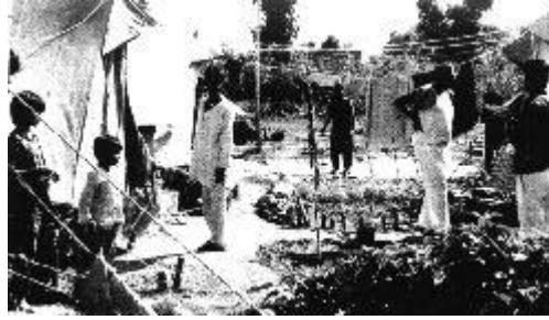
One of many refugee camps at Jammu.