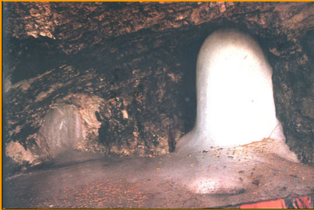
The Natural Ice-Lingam of Shri Amarnathji