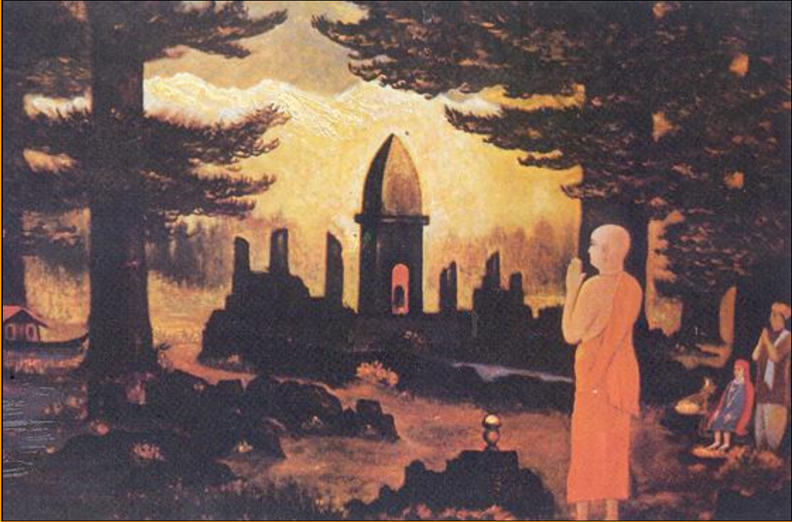
Swami Vivekananda at Kshir Bhawani, Kashmir