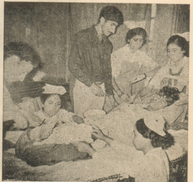
Brutally injured Teen—ager