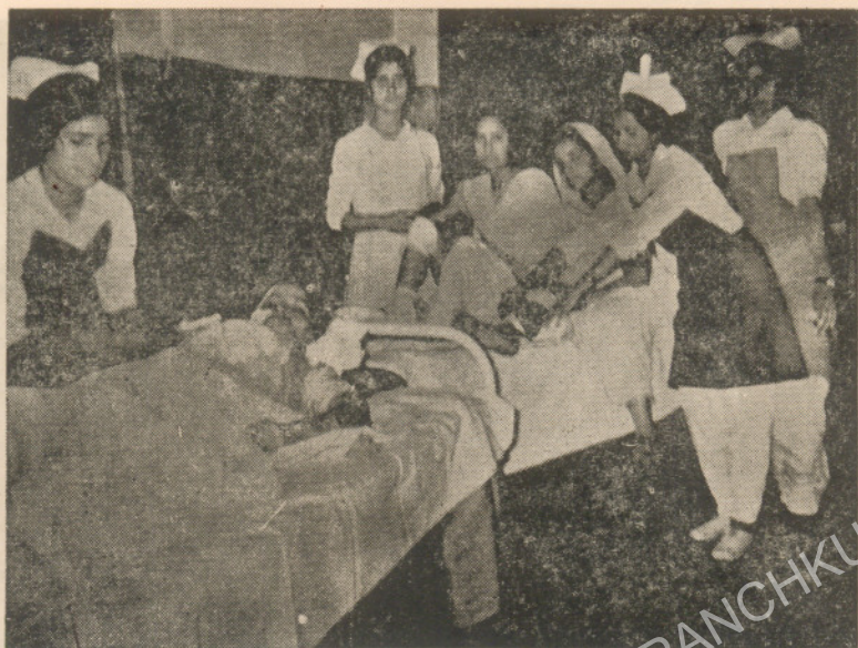
A woman victim of Lathi Charge