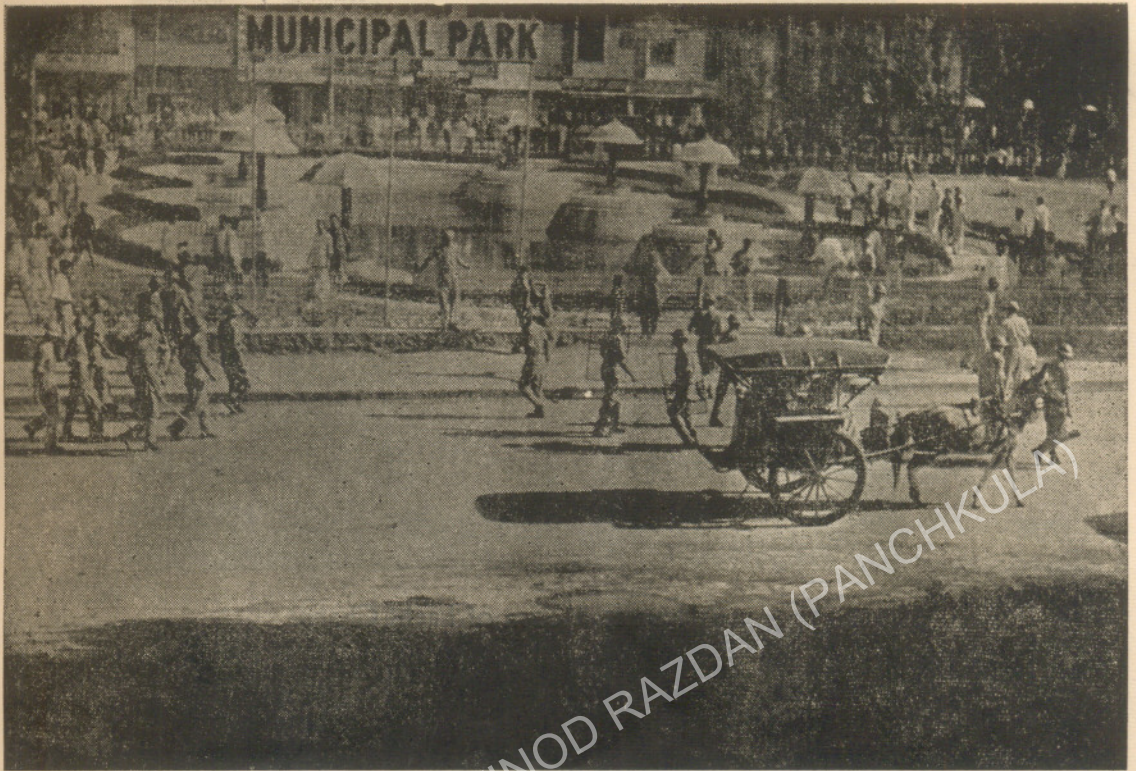
A Further Scene of Police atrocities on August 15th.