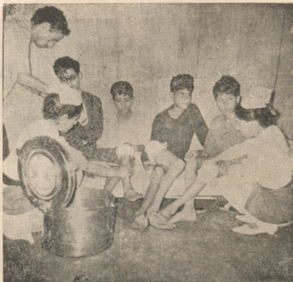
Even Teen—agers were not spared