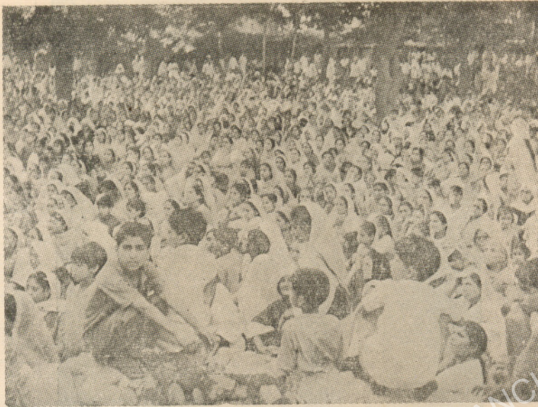
Protest Meeting of Ladies at Shivala against Police excesses of 27th August.