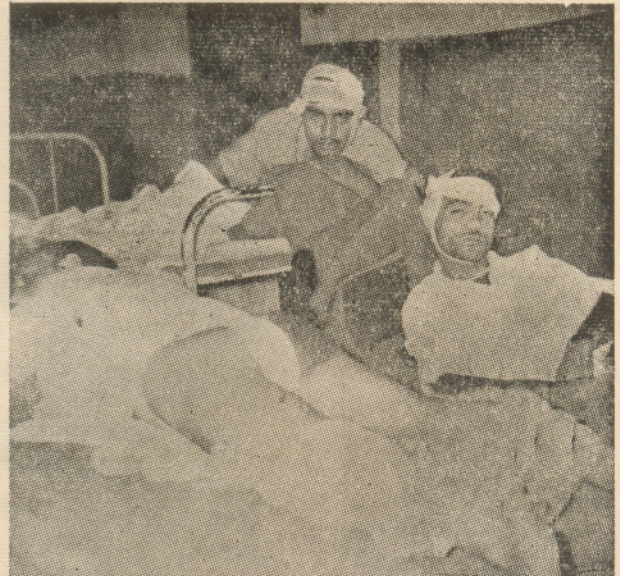
The victims of Hooliganism at Maisuma and Gaokadal in Rattan Rani Hospital.