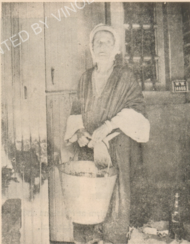
Even old persons were not spared